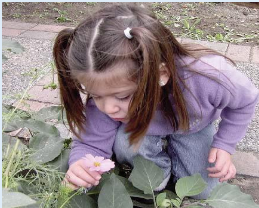
ELCC Consultants support licensed childcare centres and homes to implement quality programs.

ELCC Consultants provide a variety of supports to your child's centre or childcare home. Consultants support childcare home providers, centre staff, directors, and boards of childcare centres to implement best practices in the care and education of your child.